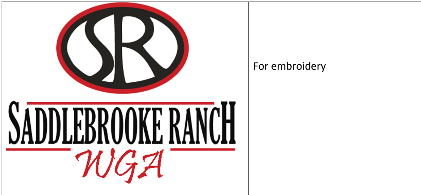
Exhibit D – Proposed New Logos