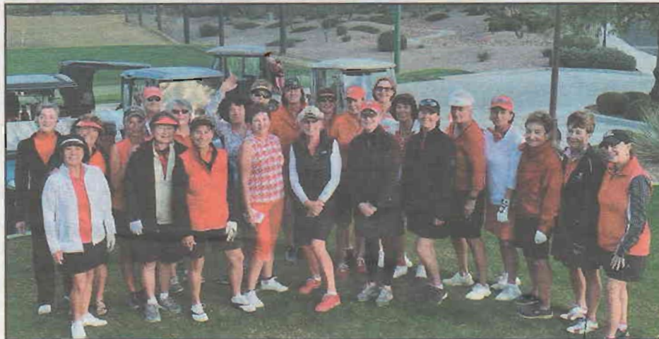
Seeing red, this team had a team cheer to get their adrenaline going.